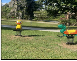
Trussett Park Playground