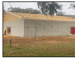
Fire House Addition