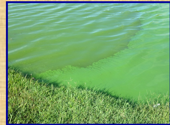
Example of harmful algal bloom.